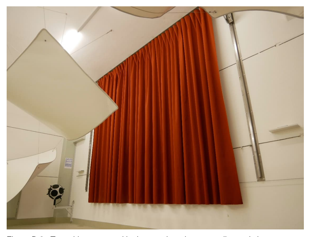
Figure B.2. Test object mounted in the reverberation room, diagonal view.